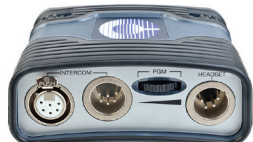
RS-702 Bottom View