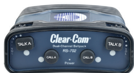
RS-702 Top View